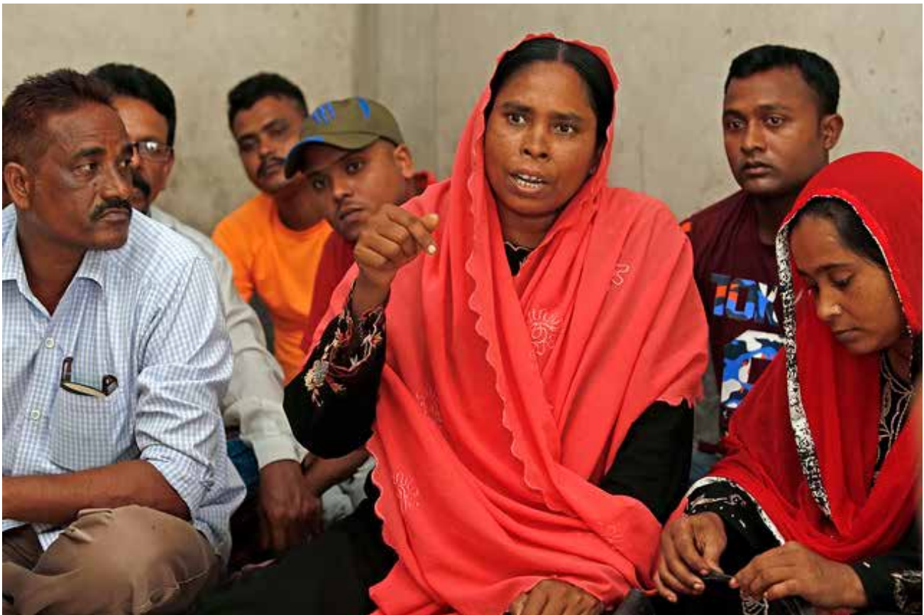
Photo: A woman from grass root level, expressing her opinion on engaging more women in community based discussions and decision making processes /Photo credit: UN Women