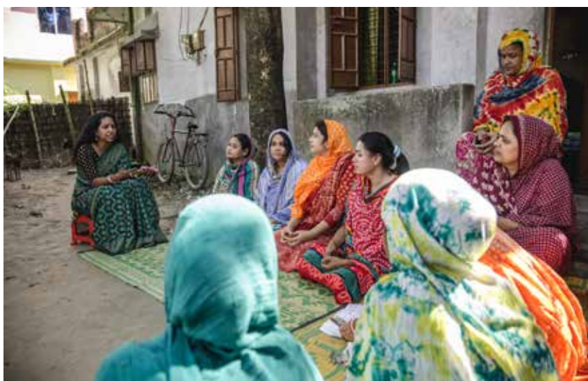
Photo: Group of women discussing in a courtyard meeting about how they can prevent communal conflict and any form of violence against women that affect social cohesion