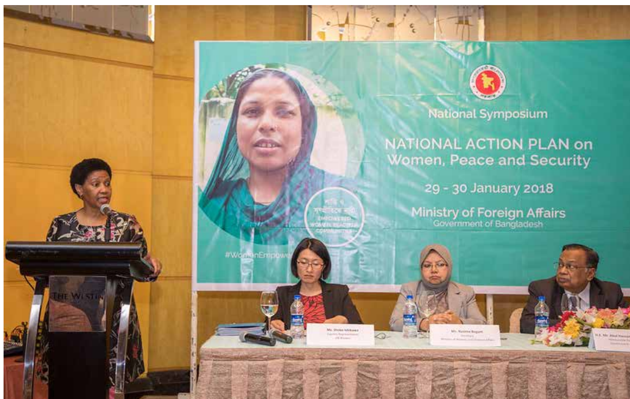
Photo: Ms. Phumzile Mlambo-Ngcuka, the Executive Director of UN Women speaking at the Symposium of National Action Plan on Women, Peace & Security held in 2018

The drafting process and timelines are summarized in the table below: