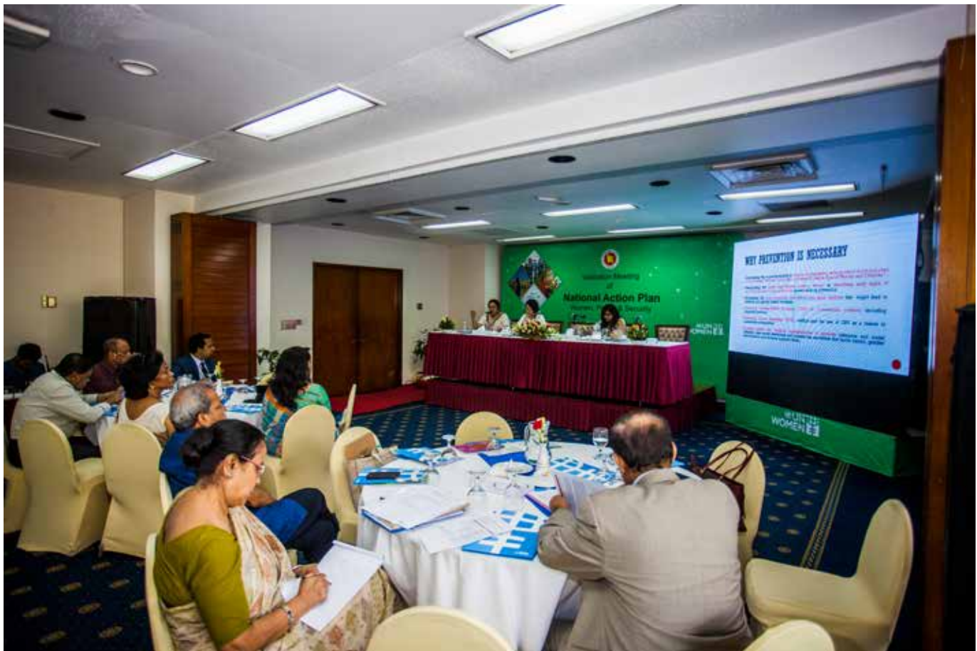
Photo: Validation Meeting of National Action Plan on Women, Peace & Security held in August 2019

MOFA is the ministry responsible for producing the public report reflecting the progress of the implementation of the NAP. At the end of the three-year period of the NAP, a thorough review will assess the results by the same mechanism. Further consultations with the stakeholders may take place to review and revise the NAP for a further period. Awareness and sensitization as well as training on NAPs and gender-sensitive, results-based monitoring and review will be organized for relevant ministries and stakeholders forming the Consultative Platform to ensure that institutional capacity for effective NAP implementation, monitoring and evaluation are strengthened.