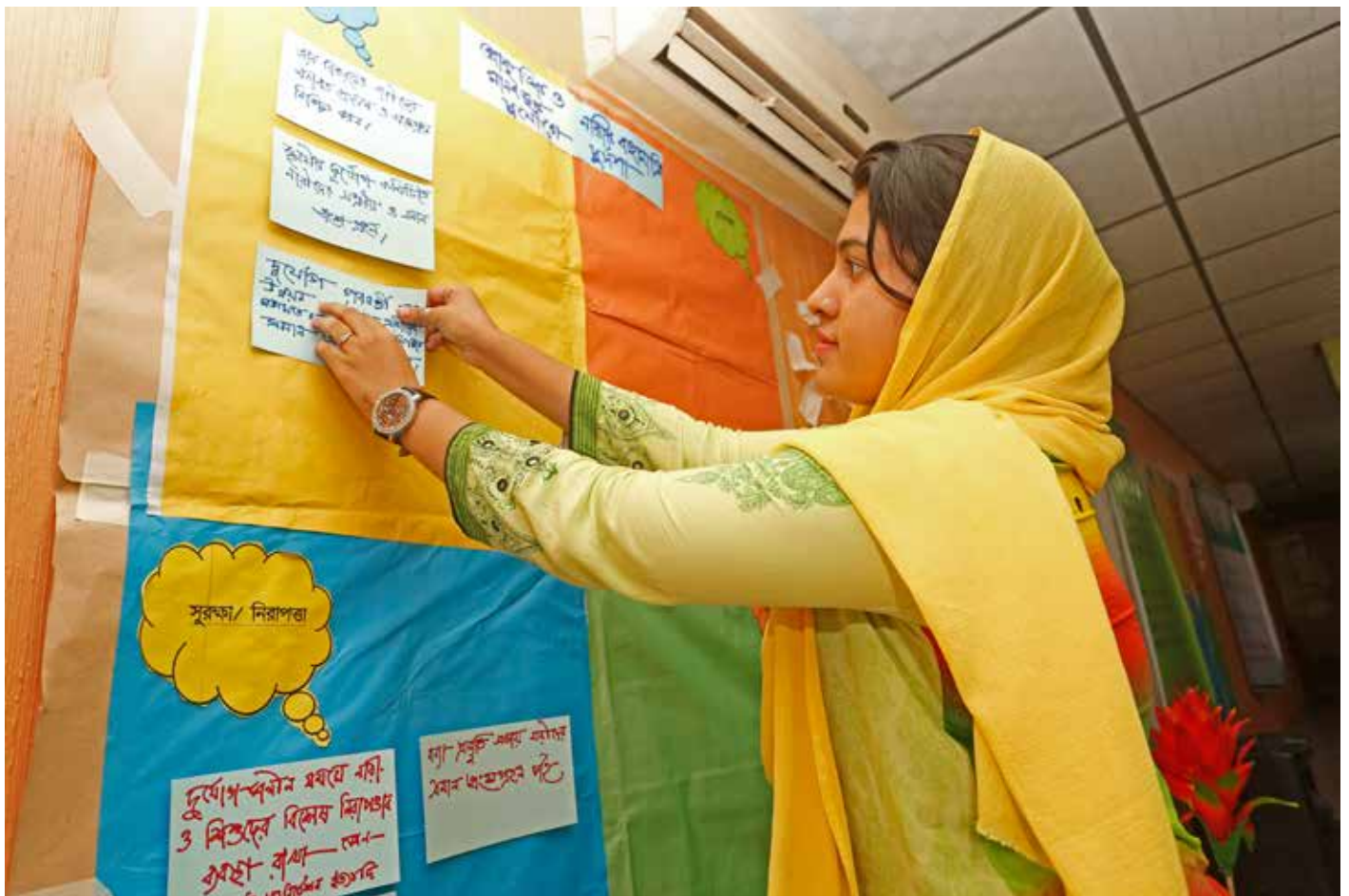
Photo: A woman in one of the district level consultations providing her recommendation on 'Relief and Recovery'

Bangladeshi female peacekeepers contribute to reducing gender-based violence and to preventing conflict in areas where they serve, providing a higher sense of security especially for women and children. In addition, it is important to ensure that pre-deployment training for all personnel both female and male engaged in peacekeeping operations includes gender awareness, orientation on the women, peace and security normative agenda, and strategies for the prevention of sexual exploitation and abuse.