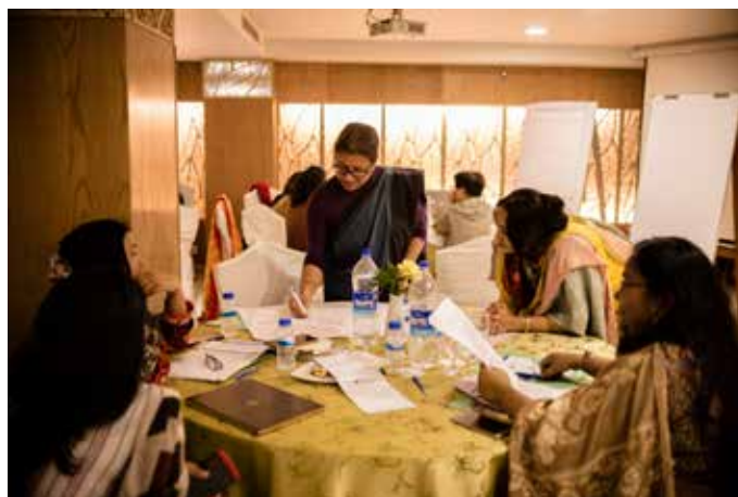
Photo: Members of CSO network in a consultation providing their final recommendations on the National Action Plan on Women, Peace and Security